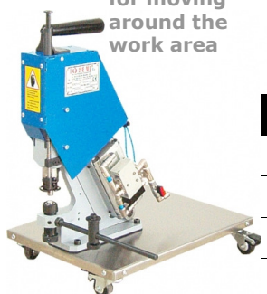
Mobile version for moving around the work area

Hanolex Ltd 246 Whitworth Road Rochdale Lancashire OL12 0JL t: 01706 656 789 f: 01706 659 911 e: sales@eyelets.co.uk www.eyelets.co.uk